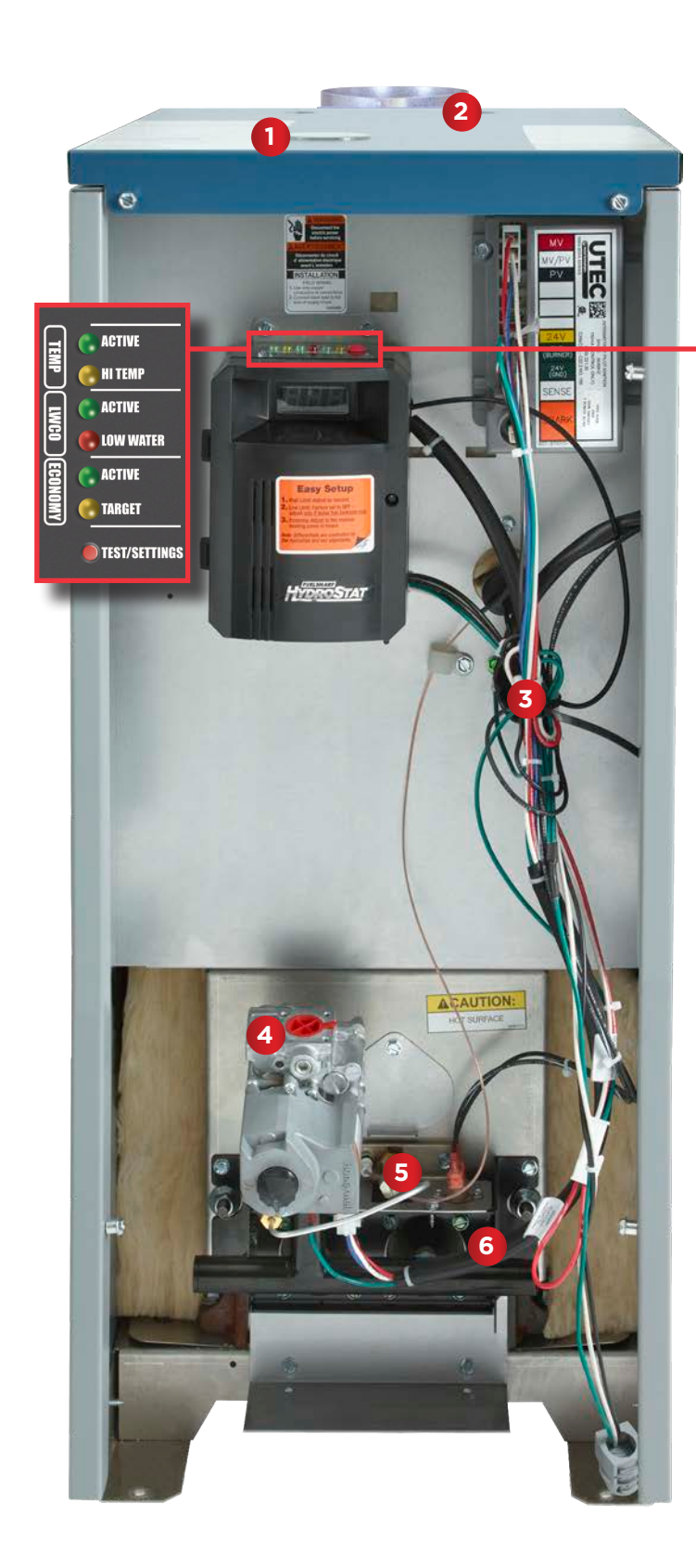
Dry Leg Casting